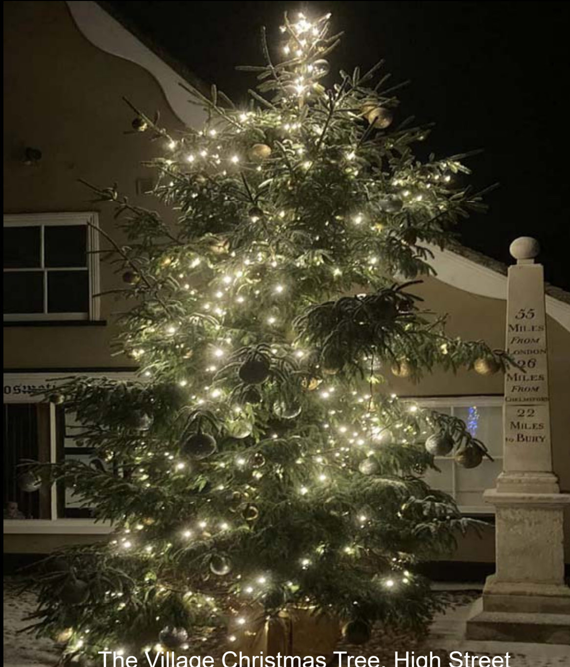
The Village Christmas Tree, High Street

How many extra large baubles are on the tree? There are 58 15cm balls on the tree