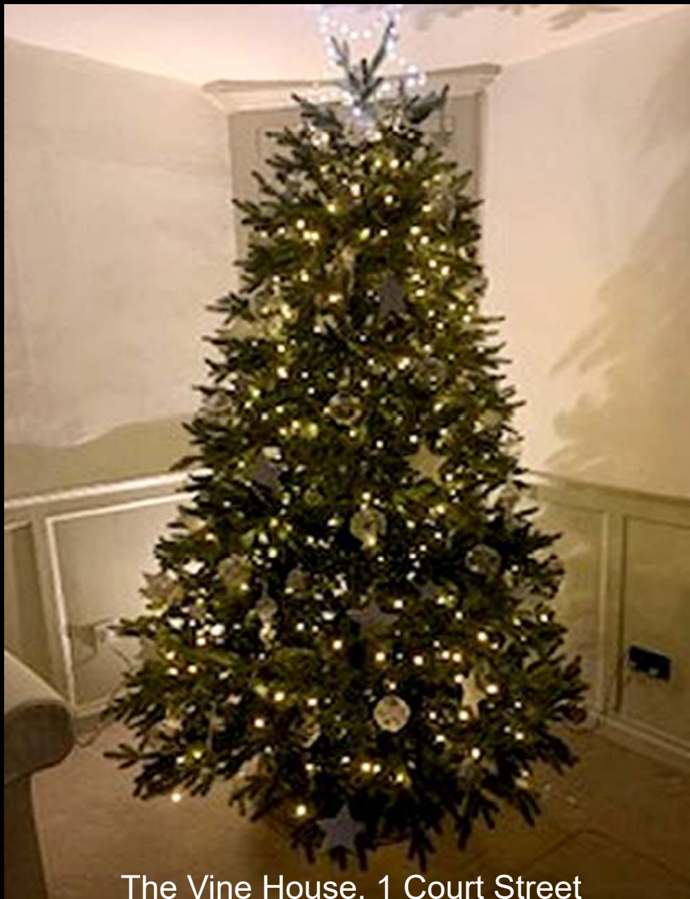
The Vine House, 1 Court Street

What colour are the decorations and what else can you think of that is this colour around Christmas time?