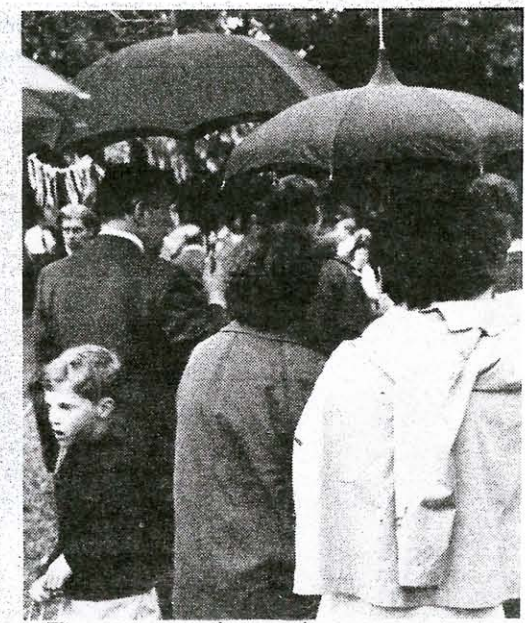
There was a shower but some came prepared.