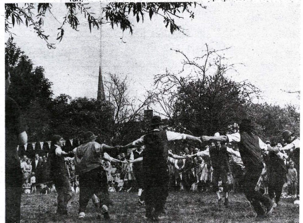
Part of the ' duile flunking ' competition, an old ale house sport.