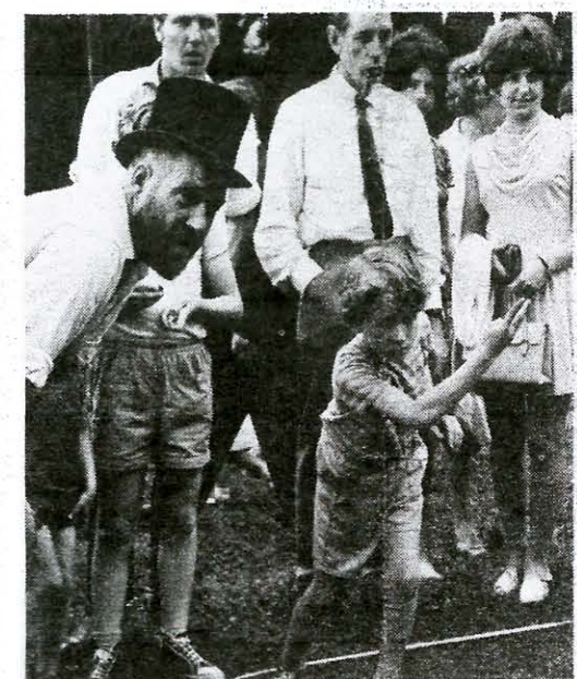
Sidestalls were part of the day's fun.