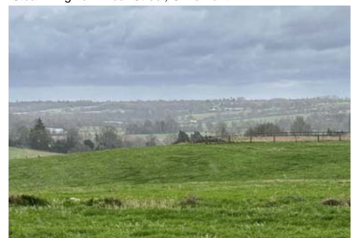
View from Wissington, James Bates