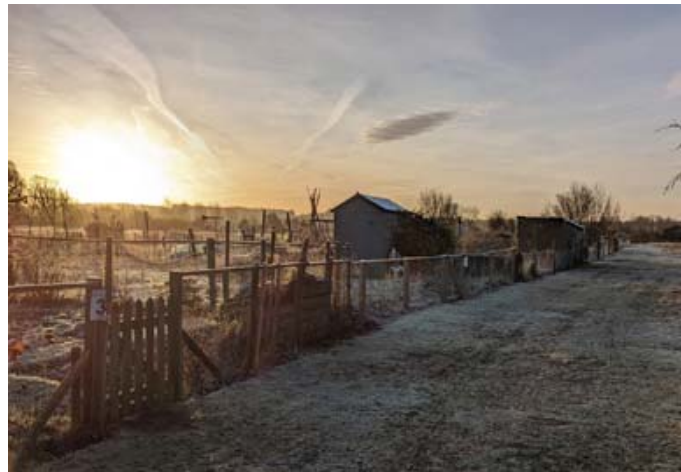
Sunrise over allotments, Jayne Kennedy

View these images in the colour version of the Community Times at www.naylandcommunitycouncil.org.uk on the Community Times page. All the photographs submitted will remain online for viewing in the Calendar page of the same website.