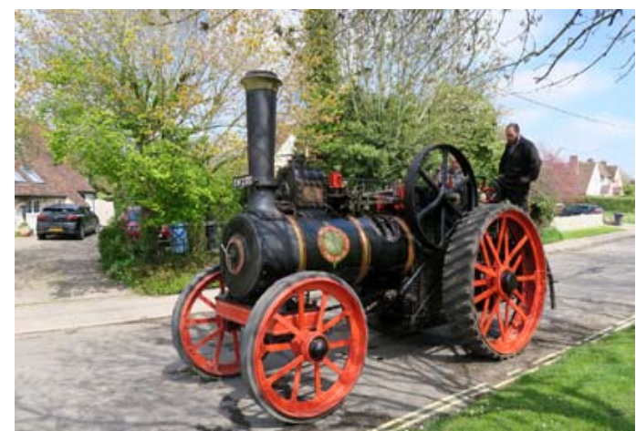
Steam Engine in Bear Street