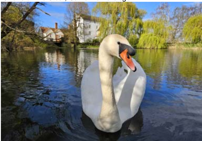
Swan at Wiston Mill